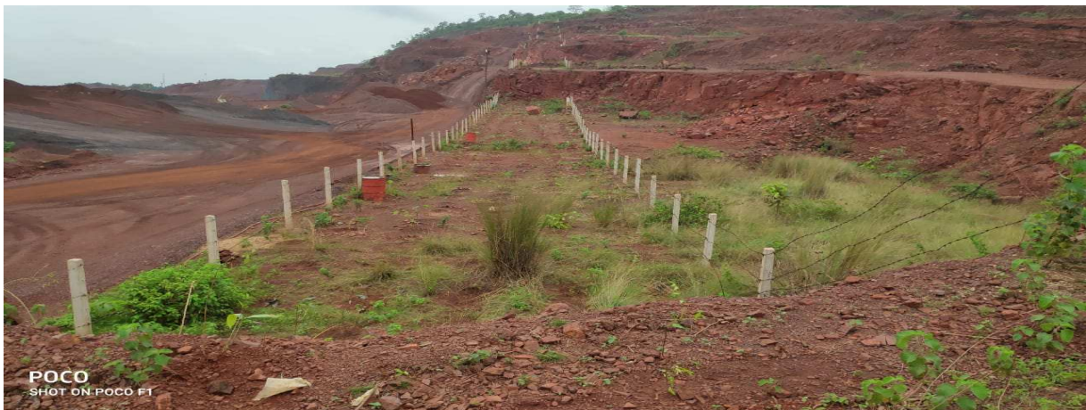
Photo showing plantation carried out in safety zone and grass patching

Murgabeda Iron Ore Mines of Sri. D.R Patnaik.