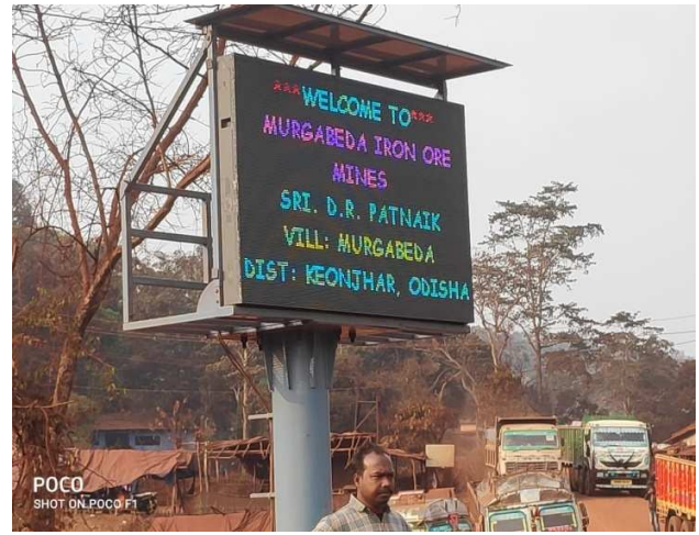
Display of Environmental parameters electronically at the entrance of mines