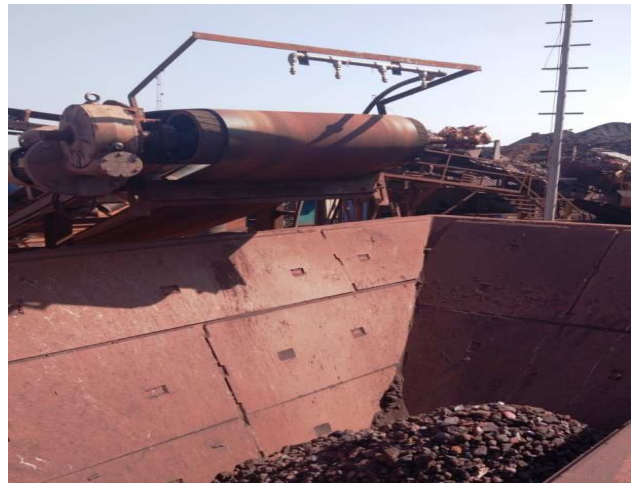
Photo showing water tanker sprinkling on road and dry fog system at screen plant