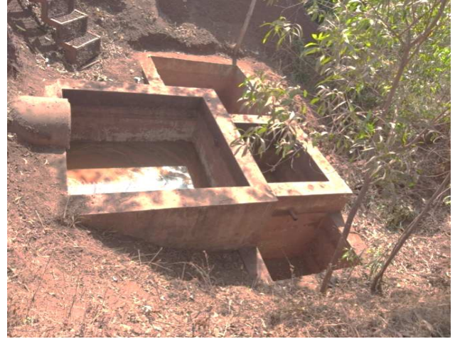
Photo showing ETP at site workshop