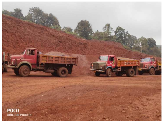
Photo showing tarpaulin cover on ore carrying vehicle