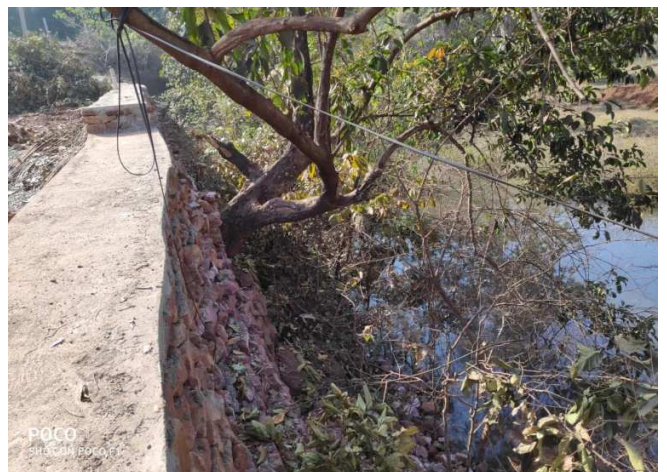
Photo showing guard wall to arrest silt going to nalla