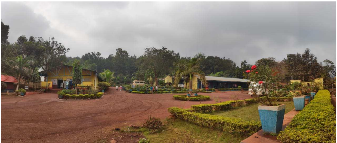
STP at staff campus and use of treated water for green belt development