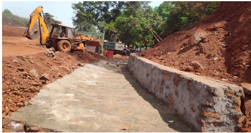
Photo showing siltation cum percolation pond and garland drain